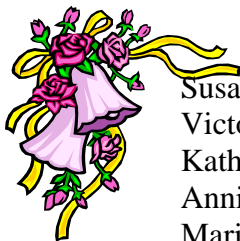
Two milestone anniversaries are applauded.

On Saturday, February 10th over one hundred couples attended our annual "Mass Celebrating Marriage". The couples renewed their marriage vows and those with Milestone Anniversaries were especially recognized. Milestone anniversaries are any multiple of five years. We congratulate all engaged and married couples at St. Francis of Assisi parish and would like to honor those with Milestone Anniversaries who gave us their names in advance.