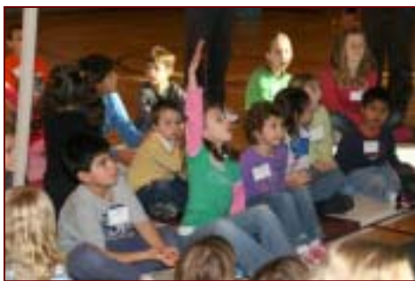
(left) Children respond enthusiastically at the Common Conference Children's Workshop last January 20, 2007.