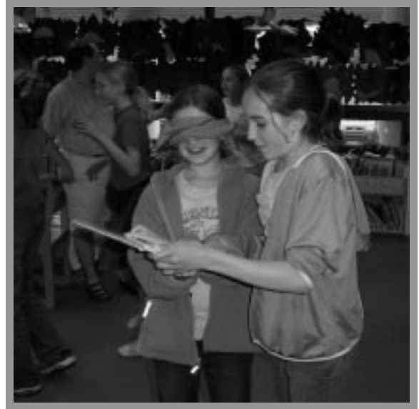
Above: At a recent Y.E.S. event, students do an exercise to help them experience what it's like to have a disability