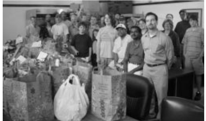
Above: The spectacular food drive from St. Francis Parish to benefit HIV/AIDS clients that are assisted through the Wellness House of Michigan, in Detroit