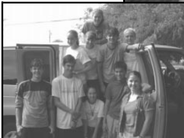
The group gets a quick picture before heading off to Kings Island.

and presentations by the Catholic Heart staff. They survived nearly 90 degree weather during the day and the sweltering auditorium in the evening. After the week of work, the group headed to Kings Island to spend a day playing before driving home.