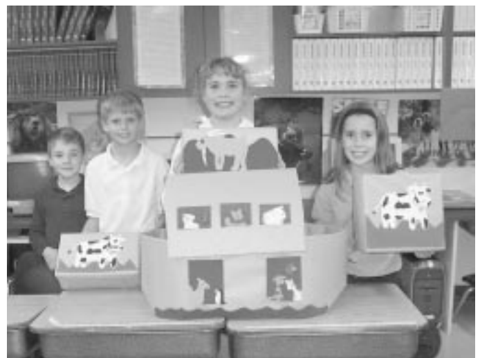
Fourth-graders at St. Francis School get ready to support the work of Heifer International. They are shown with a paper ark, the symbol of this service project.

For more information on the programs of Heifer International, visit their website at www.heifer.org or call them at (800) 698-2511.