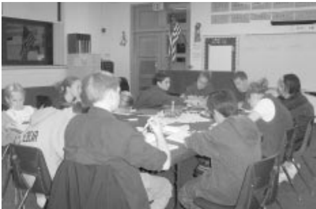
Confirmation candidates learn the importance of service during their religious education classes.

They also got involved in Service Saturday on De-